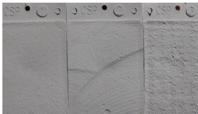
CSP1 to CSP3

For coloured adhesives mix with 2 boxes (4 individual pigment pouches) of PERMACOLOR® Select pigment packs for each 20 kg bag of 254 adhesive, White only. Check to ensure colour match and acceptability with grout prior to use.