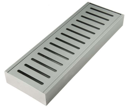
Standard Floor Grate PRODUCT CODE: LCFGRATE

All Lauxes grates and accessories have received WaterMark Certification in accordance with ATS 5200.040. Warranty information, as well as Care & Maintenance can be found at www.lauxesgrates.com.au