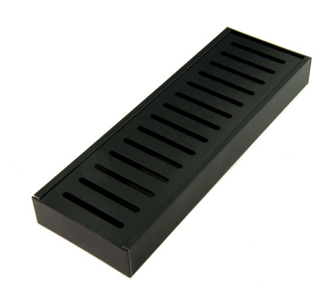
Standard Floor Grate (Midnight) PRODUCT CODE: LCMFGRATE